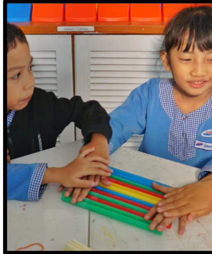
Children builds based MOP