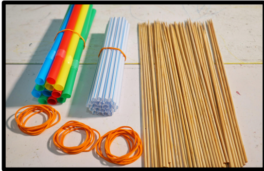
Group leader take the materials given by the teacher