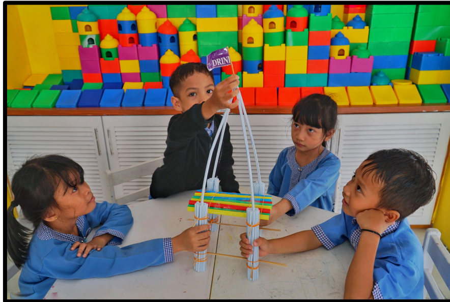
Children work together to complete MOP structure