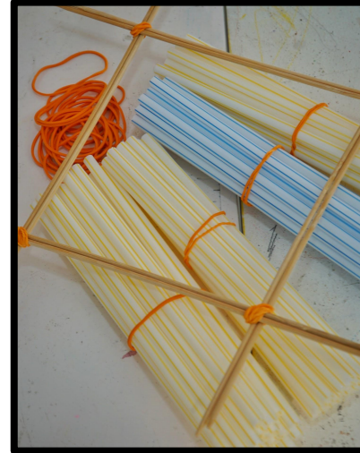
Children build frame connector