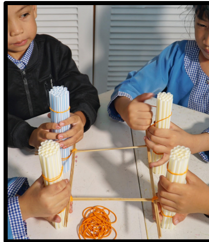
Children build MOP tower